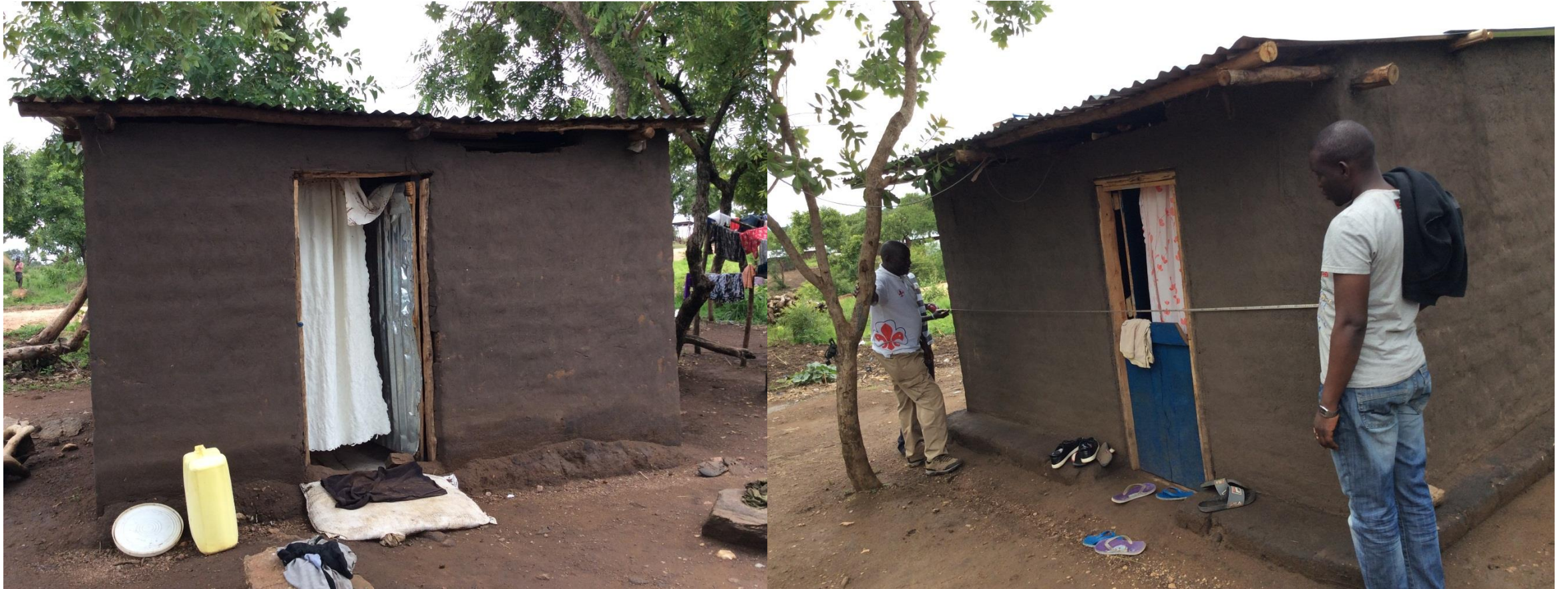
Sample of a semi-permanent Hut built using local materials