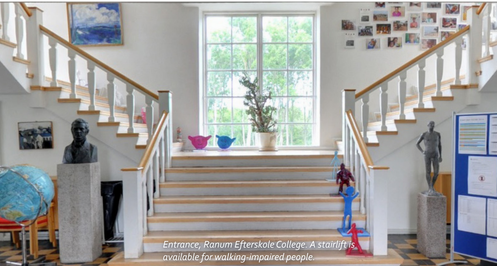
Entrance, Ranum Efterskole College. A stairlift is available for walking-impaired people.

Over the years, ISGF European Conferences have been held in various localities and forms.