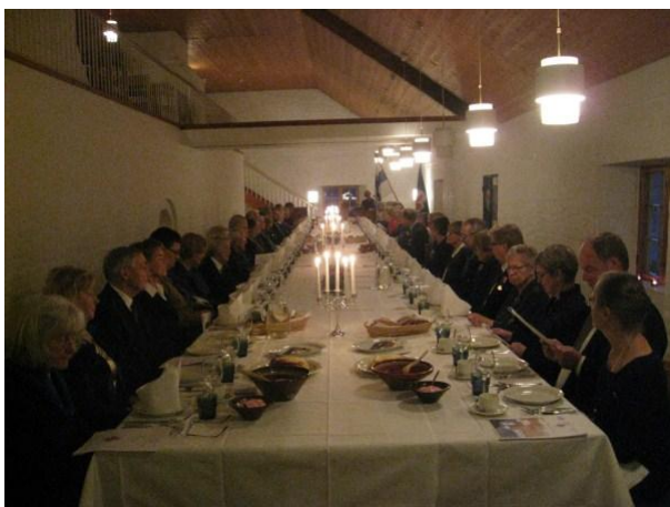
From the 60 year celebration

Here in Finland we are still working with the final completion of our new constitution. We called our members to an annual meeting according to the new constitution and intended to elect a new board of 8 members and take other needed decisions. But the mills of the authorities are grinding a lot slower than what we accounted for. We have not yet got the constitution approved by the authorities and therefore the annual meeting for 2012 had to continue along the lines of the old rules. This meant that the new board got elected for one year only and with the same amount of members as before (6). The Guild