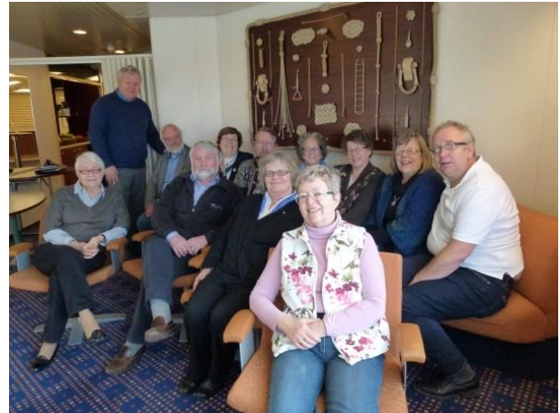
From the planning of the Conferece taken on the ship m/s Mariella