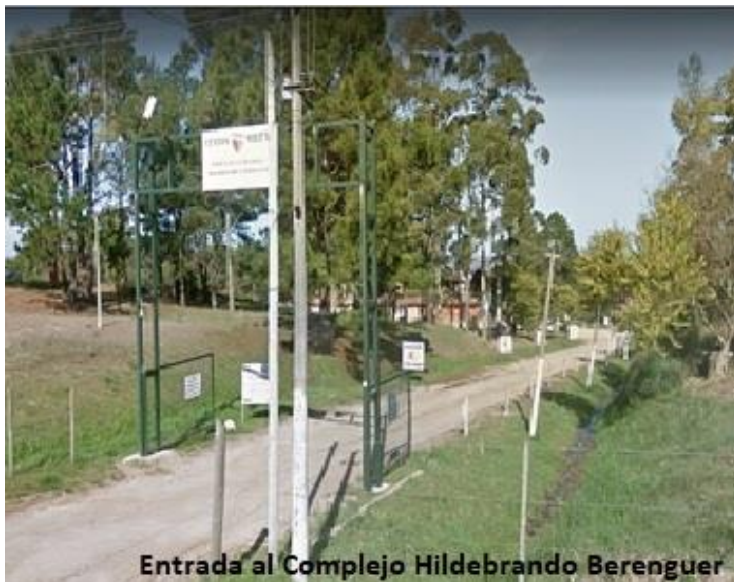
Entrada al Complejo Hildebrando Berenguer

We continue working very hard to give our future visitors the best attention, in what will be our second Gathering in our country.